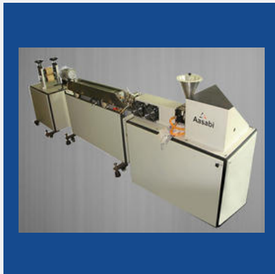
Lab Extruder with attachments