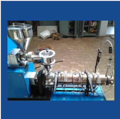
LAB Conical Twin Screw Extruder