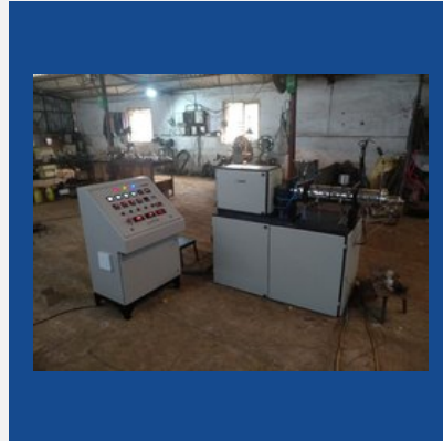
Extruder for Biodegradable Polymers