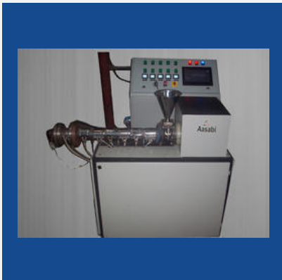
Extrusion Capillary Equipment