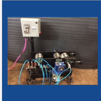
Lab Sheet Extruder