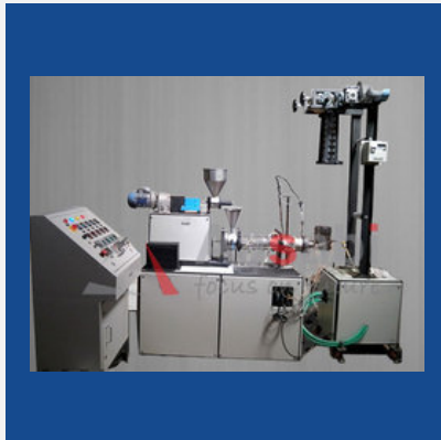
LAB Twin Screw Extruder With Split Barrel