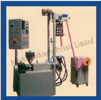
Lab Blown Film Extrusion Equipment