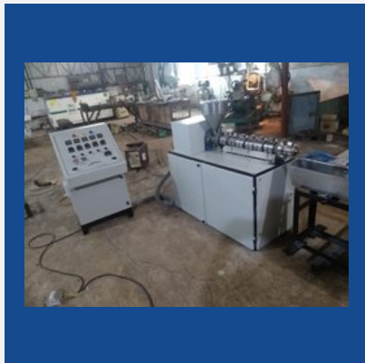
Mini Lab Single Screw Extruder