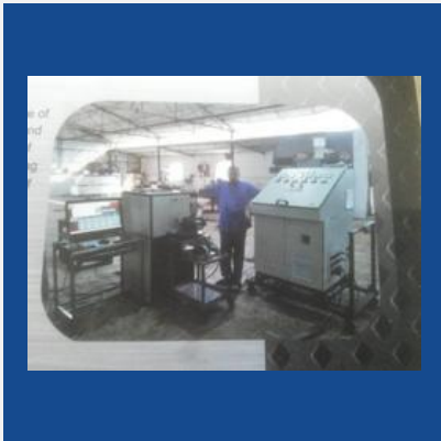
Lab Sigma Mixer