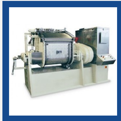
Sigma Kneader Mixer