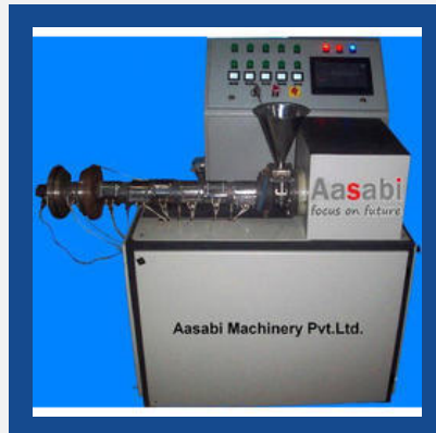
Filter Pressure Value ( FPV ) Machine